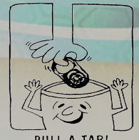
PULL A TAB!