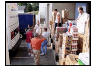
Supplies pour into the Gulf Coast but much more help is needed

Add our website to your list of favorites! http://selc.lcms.org